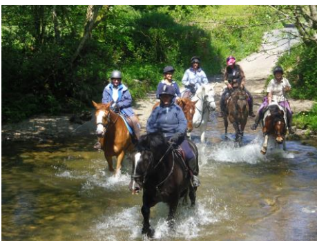
Hosted hack Burrator